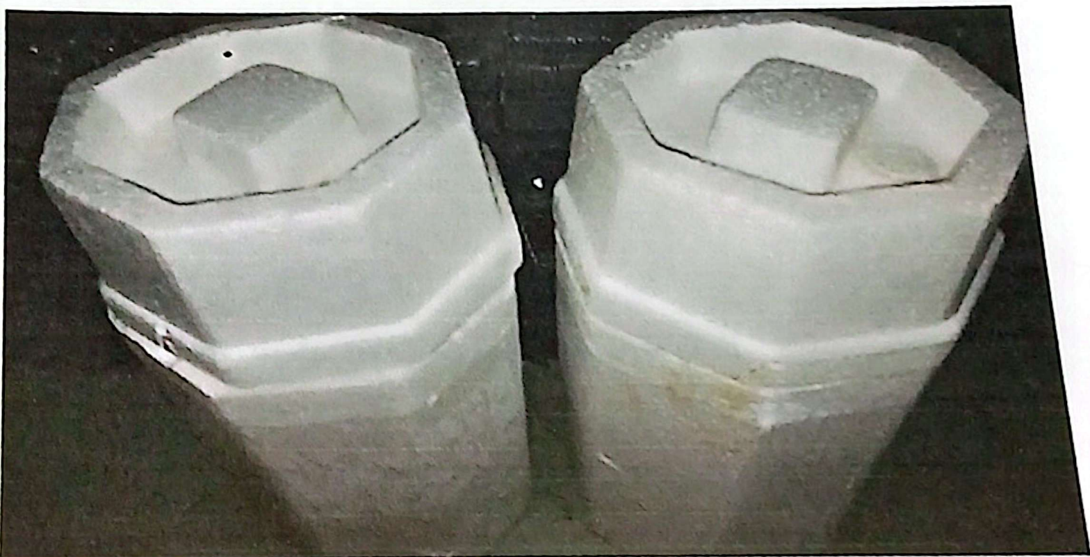
Petroleum Ether storage