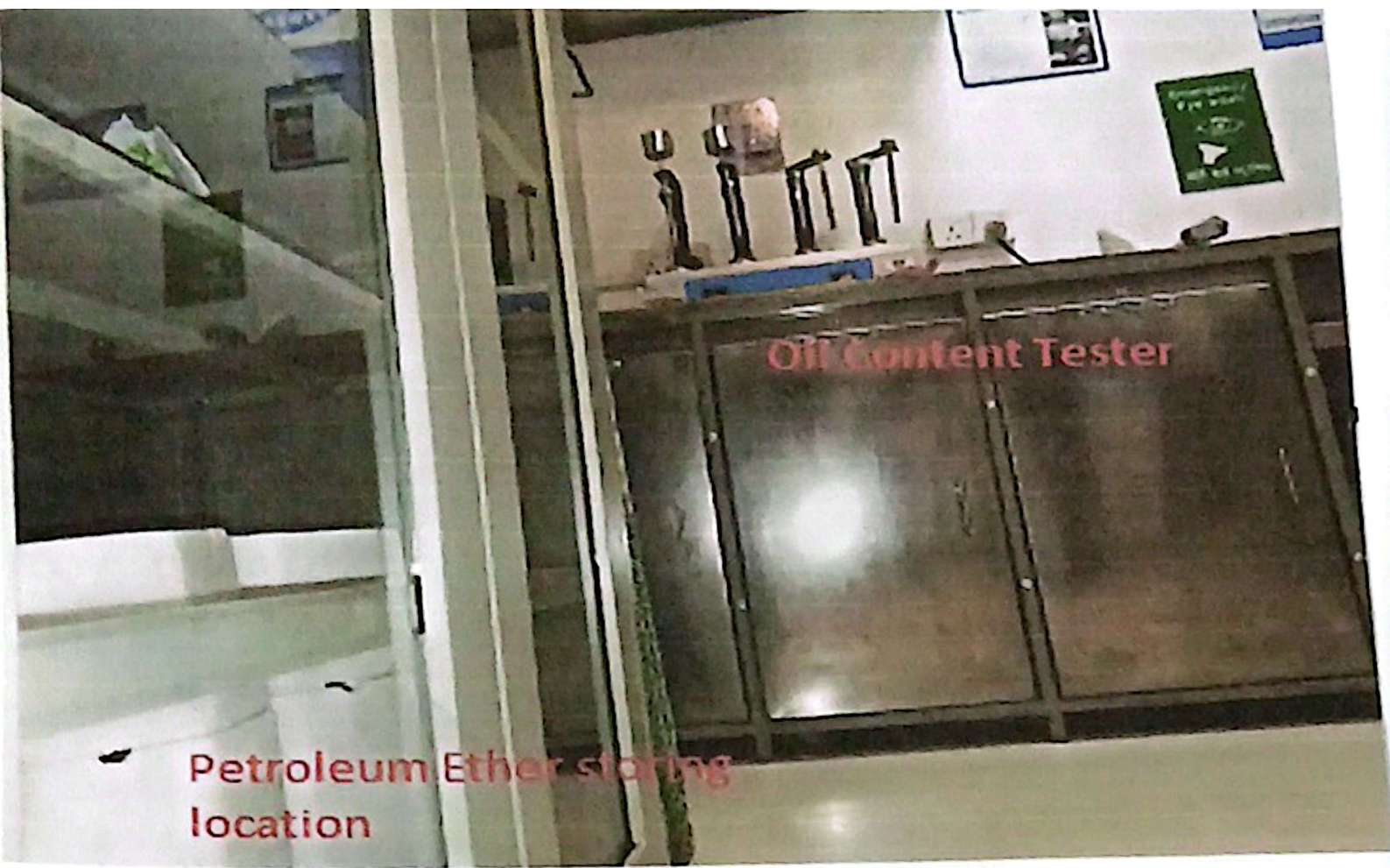
Petroleum Ether storing location